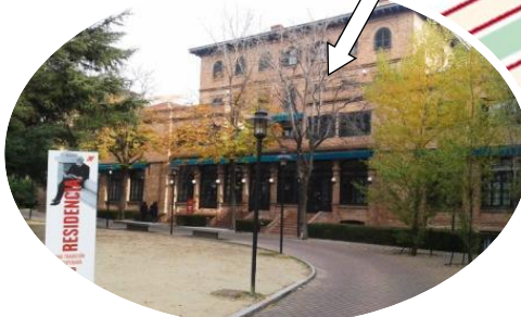
Residencia de Estudiantes Pinar 21